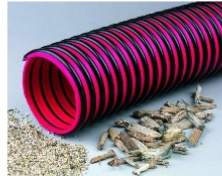
Click Here to Enlarge Picture

March 7, 2005 - Static Conductor Hose facilitates safe industrial clean-up, offering alternative to rubber hose in applications where static build-up is of concern. Conductive properties allow for safe grounding when used with metallic fittings. Medium-duty hose features chemical and heat resistance of TPR, is UV-stabilized for outdoor use, and has smooth interior for optimized flow. Product comes in 2-6 in. sizes with -20 to +165°F operating temperature range.