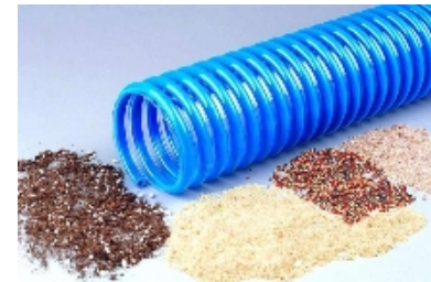
Click Here to Enlarge Picture

March 9, 2005 - TPU VAC Hose is lightweight and handles abrasive media under vacuum. Features include all-weather construction resistant to ozone attack, polyurethane wall for abrasion resistance and smooth inner tube for maximum product flow, and external wear strip that prevents damage from abrasion. Available in sizes ranging from 4–8 in., with larger sizes available, hose operates from -50 to 200°F and is rated for full vacuum.